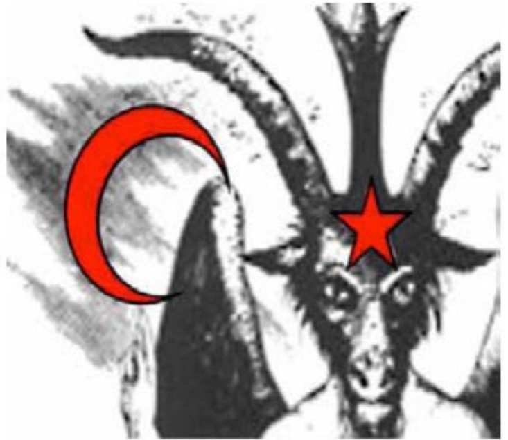
Baphomet / Occult

In the realm of the spirit, everyone knew that both were chanting. Their chantings were offered up to satan. Their worship of hand movements were an offering to satan.