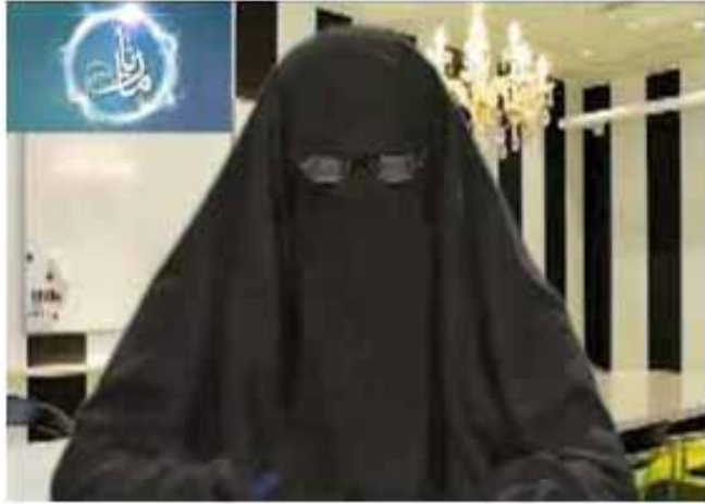
Islamic Black Crow Outfit