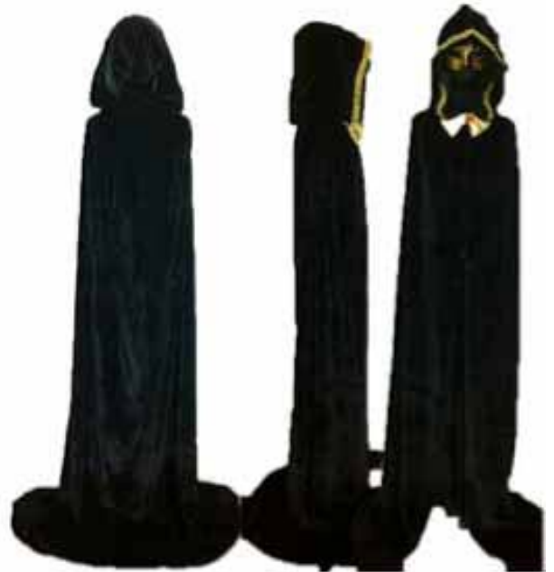
Gothic Hooded Cloak/Wicca Robe Medieval

I understood that this woman had mystical powers of darkness. She knew that her source and power was directly from satan.