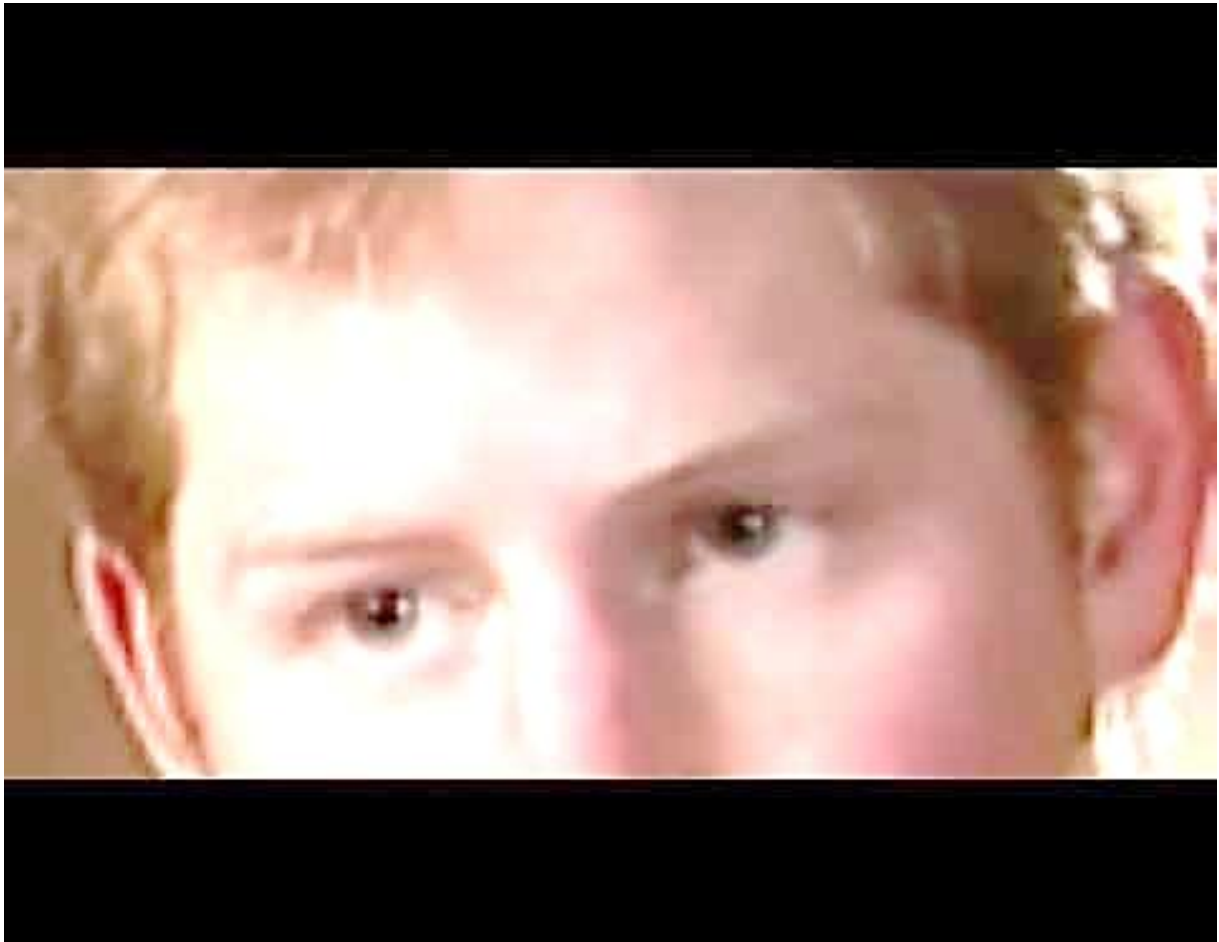
[Prince Harry Reptilian Lizard eyes]

As a result of his actions, he began to shapeshift. It began with his arm changing shape and colour, resembling a reptilian.